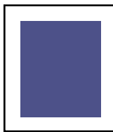
Full page 7.375 x 9.875 in