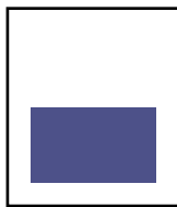
½ page hor. 7.208 x 4.75 in

Live area of bleed page ads is (7.875 x 10.373 in).